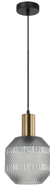
MARACA1 (Smoke glass & Antique Brass Highlight)