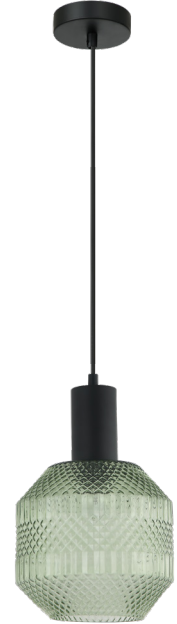
MARACA2 (Green glass & Black Highlight)