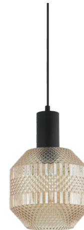
MARACA3 (Amber glass & Black Highlight)