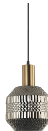
MARACA5 (Matte gold glass & Antique Brass Highlight)