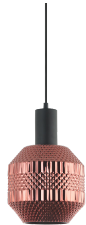
MARACA4 (Copper glass & Black Highlight)