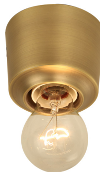
DIYBATC03 (Antique Brass)