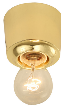
DIYBATC02 (Polished Brass)