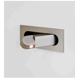
CODE: 1323012 FINISH: MATT NICKEL