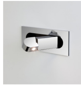
CODE: 1323010 FINISH: POLISHED CHROME