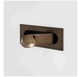
CODE: 1323011 FINISH: BRONZE