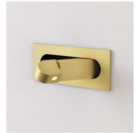
CODE: 1323013 FINISH: MATT GOLD