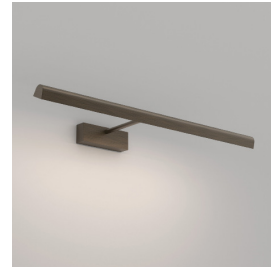
CODE: 1371016 FINISH: BRONZE

TO MAINTAIN THIS PRODUCT TO ITS BEST CONDITION, PLEASE VIEW OUR CARE AND CLEANING GUIDE ON THE SUPPORT SECTION OF THE ASTRO WEBSITE.