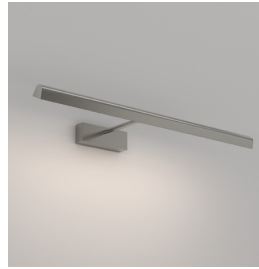
CODE: 1371015 FINISH: MATT NICKEL