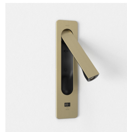
CODE: 1437007 FINISH: MATT GOLD