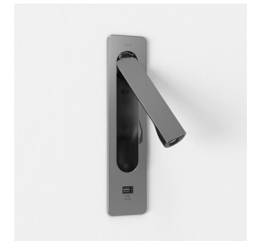
CODE: 1437006 FINISH: POLISHED CHROME