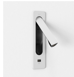
CODE: 1437005 FINISH: MATT WHITE