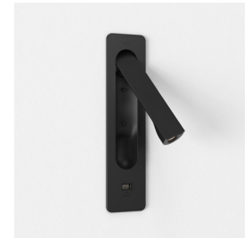
CODE: 1437004 FINISH: MATT BLACK