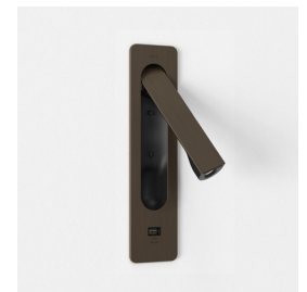
CODE: 1437008 FINISH: BRONZE

TO MAINTAIN THIS PRODUCT TO ITS BEST CONDITION, PLEASE VIEW OUR CARE AND CLEANING GUIDE ON THE SUPPORT SECTION OF THE ASTRO WEBSITE.