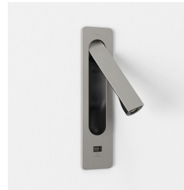
CODE: 1437001 FINISH: MATT NICKEL