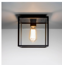
CODE: 1354001 FINISH: TEXTURED BLACK