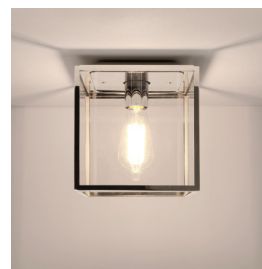
CODE: 1354002 FINISH: POLISHED NICKEL

THIS PRODUCT IS NOT SUITABLE FOR INSTALLATION WITHIN FIVE MILES OF THE COAST. FOR THESE ENVIRONMENTS, PLEASE FILTER PRODUCTS ON THE ASTRO WEBSITE BY 'COASTAL'.