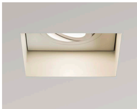
CODE: 1248007 FINISH: MATT WHITE

TO MAINTAIN THIS PRODUCT TO ITS BEST CONDITION, PLEASE VIEW OUR CARE AND CLEANING GUIDE ON THE SUPPORT SECTION OF THE ASTRO WEBSITE.