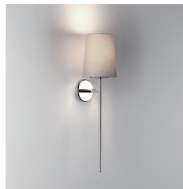
CODE: 1388001 + 5033002 FINISH: POLISHED CHROME